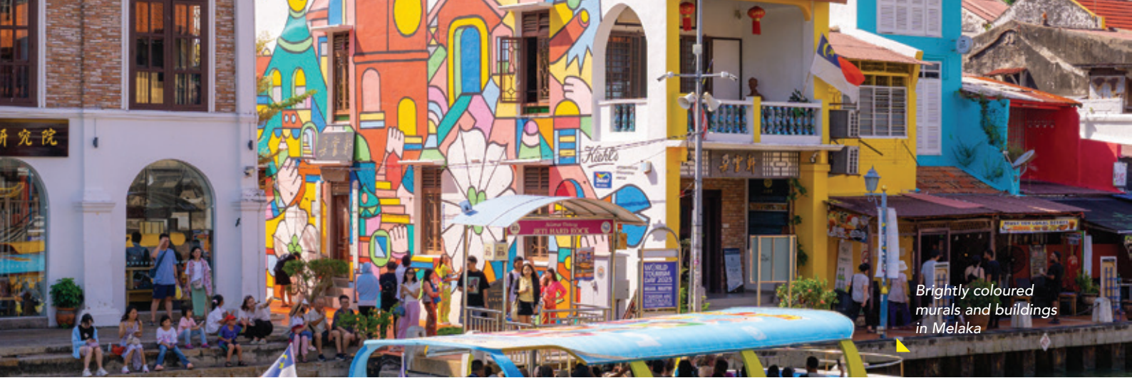
Brightly coloured murals and buildings in Melaka

“And God saw everything that He had made, and behold, it was very good.