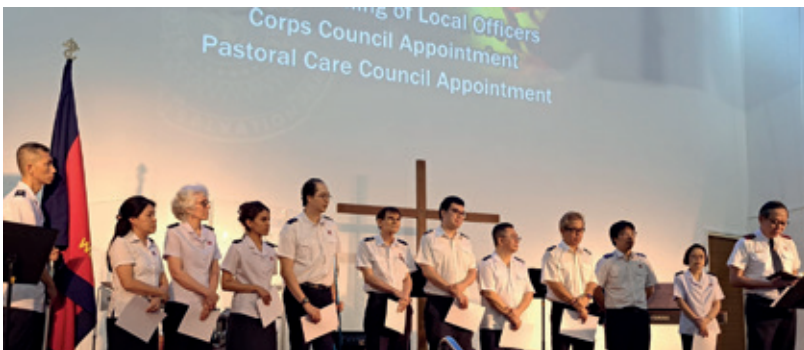
Installing of Corps Council and Pastoral Care Council.