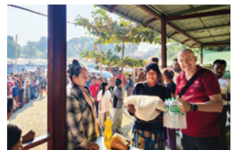
Chief Secretary Lt. Colonel Nigel Cross distributing essentials to locals.

A significant portion of the beneficiaries—167 families—are currently living in temporary shelters, displaced by earthquake-related destruction. The remaining 133 families travelled from other shelter locations to access assistance, underscoring the disaster's widespread impact and the urgent need for coordinated relief across affected communities.