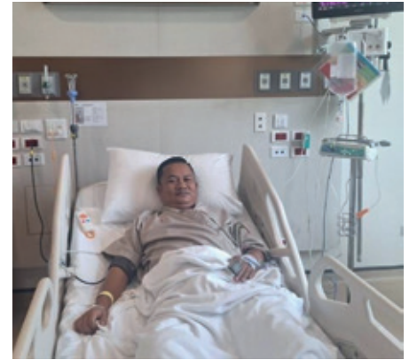
Admitted to Bangkok Hospital.

Looking back, I see God's mercy at work. If this had happened elsewhere, the outcome could have been different.