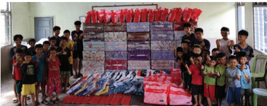
Boys of the Pyu Children's Home posing with new items for their home.

Equally important were the enhancements made to the study and library areas. New study tables and bookshelves were purchased and installed, transforming these spaces into more functional and inviting learning environments. With better furniture and organised storage, the children now find it easier to read, study, and keep their materials neat. These improvements have encouraged positive study habits and provided a setting that supports concentration and personal development.