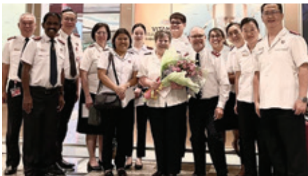
The welcome at Changi Airport.

As the pilot's voice broke through the cabin's silence, a wave of emotion washed over us. Our eyes brimmed with tears as he said, "Welcome to Singapore." Twenty-five long years had passed since we first dreamed of this moment, longing for the chance to serve globally. Now, as we descended, we could hardly comprehend the journey that lay ahead, but deep in our hearts, we felt the stirring of something truly special and knew that we were standing on the eve of something extraordinary.