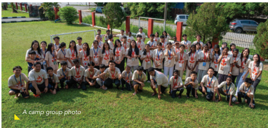
A camp group photo