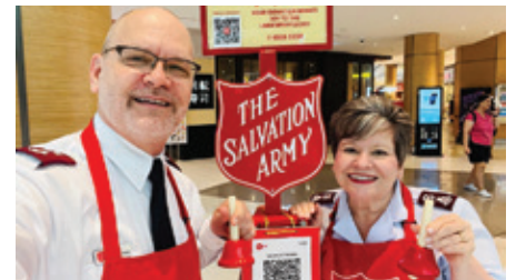
The couple kettleing together at a mall.