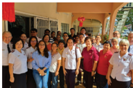
Malaysia Joyhaven Congregation at the Reopening of Joyhaven

Malaysia continues to make steady progress through children’s homes, corps ministry, after-school programmes, Red Shield Industries, and senior care. The rededication of Joyhaven Senior Care in January reaffirmed a commitment to providing quality care while sharing God’s love. Outreach to unreached communities also remains a key focus.