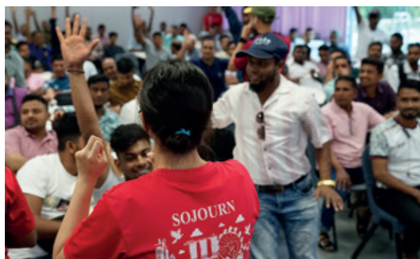
Reaching out to migrant communities during the Good Friday outreach at William Booth Corps.

Across every gathering, God's presence was evident—not only in the visible responses but also in the unseen details. The unity of those serving and the provision that exceeded expectations were clear signs of His work.