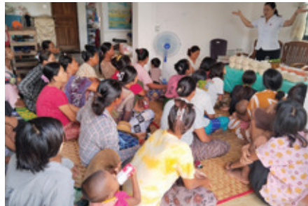
A planted corps in Mandalay, Myanmar.

We also rejoice in Chiang Rai, where the outpost was officially recognised as a Corps on 29 March. Social services continue to grow across all centres, with meaningful work in refugee support, after-school care, and anti-human trafficking initiatives.