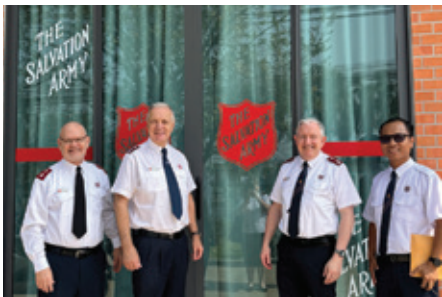
Leadership in a commemorative photo in front of the newly purchased building in Chiang Mai, Thailand.

The Singapore, Malaysia, Myanmar, and Thailand (SMMT) Territory is a vibrant and diverse region, shaped by many cultures and contexts. Yet across these differences, we are united by a shared love for the Lord and a common calling to serve. We continue to witness God at work in encouraging ways throughout the Territory.