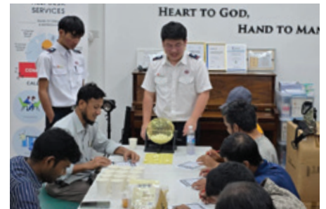
Cadets serving the migrant ministry, Sojourn, in Singapore.

In Singapore, we thank God for continued favour, with the Government awarding another nursing home site. Migrant and prison ministries are making a meaningful impact, alongside programmes such as Re:Nue, Carehaven, Children & Youth Group. The Corps are united, and when they pray together, great things happen.