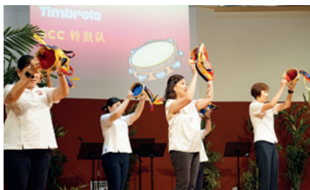
Timbrels performing during the Mandarin Outreach Service.